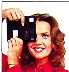
VERTICAL (Flash at top)